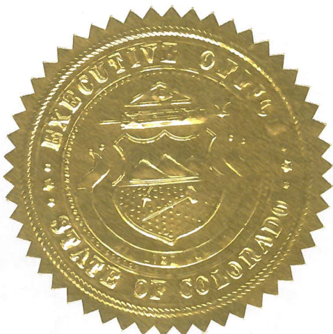
Jared Polis Governor

A handwritten signature in black ink that reads "Jared Polis".